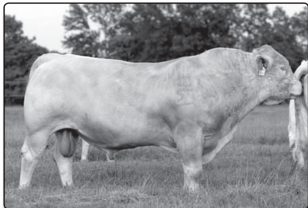
Prime Plus — Sire of Lots 6, 7 & 8