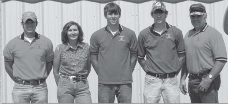
The Summerford Family