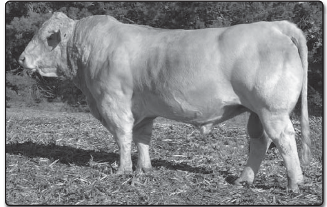
Western Edge — Sire of Lots 22 & 24

Bred AI 12-13-07 to LT Final Sort 6025 Pld. PE 1-2-08 to 3-10-08 to LT Final Sort 6025 Pld. BW: 70 lbs.; Adj. WW: 521 lbs.; Ratio: 98; YW Ratio: 100