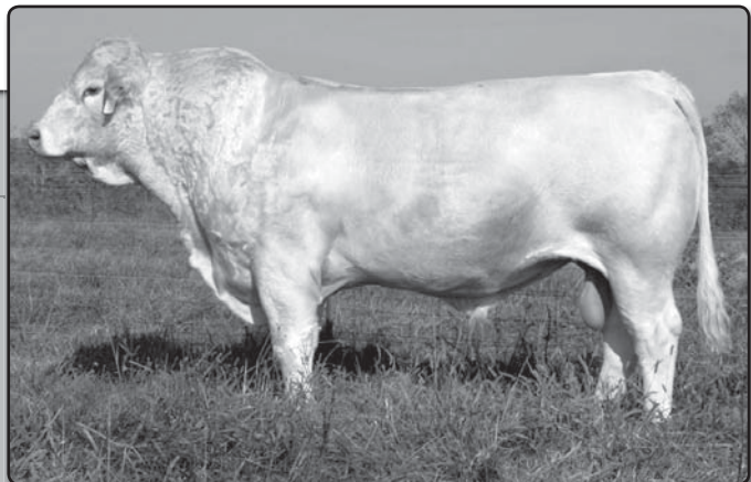
NWMSU Doc Silver 362 Pld

Bred AI 12-13-07 to LT Final Sort 6025 Pld. PE 1-2-08 to 3-10-08 to LT Final Sort 6025 Pld. BW: 80 lbs.; Adj. WW: 557 lbs.; Ratio: 105; YW Ratio: 106