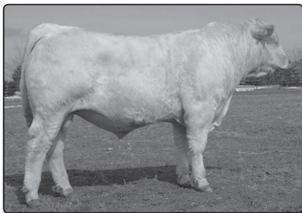
LT Final Sort 6025 Pld

LOT 7A — Polled Heifer Calf, #803. Born: 2-18-08. Sire: LT Final Sort 6025 Pld. BW: 74 lbs.