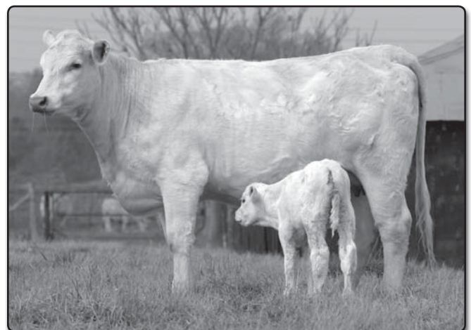
Lot 13 & 13A

LOT 13A — Polled Bull Calf, #875. Born: 3-27-08. Sire: LT Final Sort 6025 Pld. BW: 82 lbs.