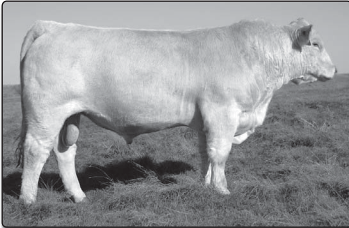
LT Thundering Wind 5200 P