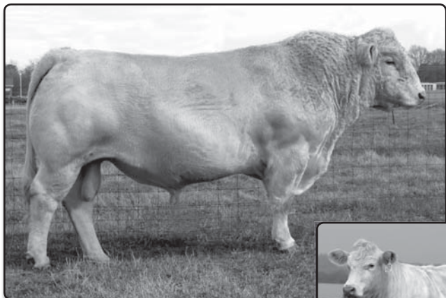
Easy Pro — His progeny and service sell